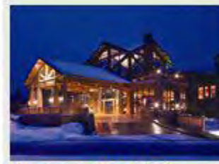
Westgate Park City Resort and Spa