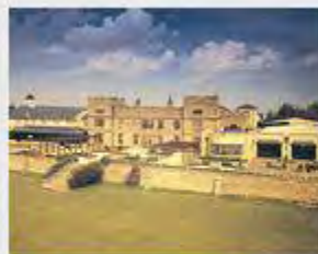
De Vere Slaley Hall