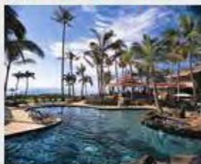
Marriott's Waiohai Beach Club